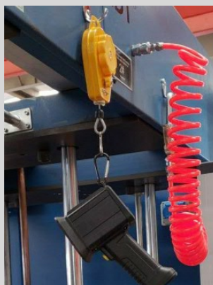
Mounting with spring balance and hook