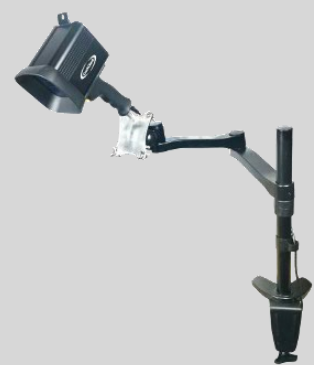
Mounting with CHiNDT FlexArm