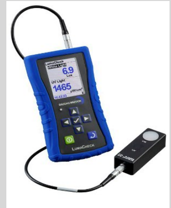
White and UV meter