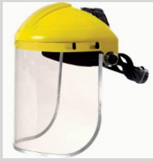
UV shield mask