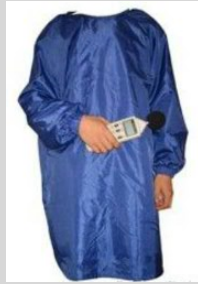
UV shield clothes