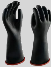
UV shield gloves