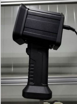
Mounting on a steel rod for mains version